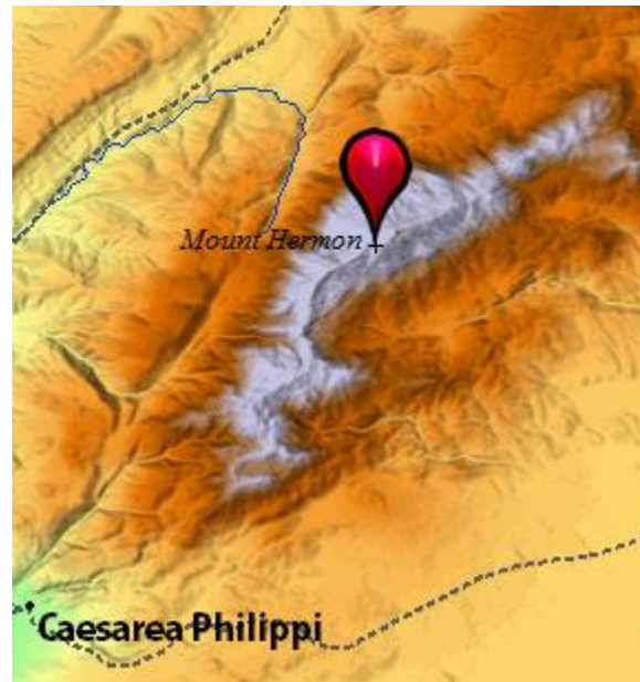
Location of Mount Hermon and Caesarea Philippi