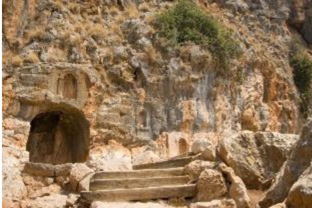
Niches which previously contained statues