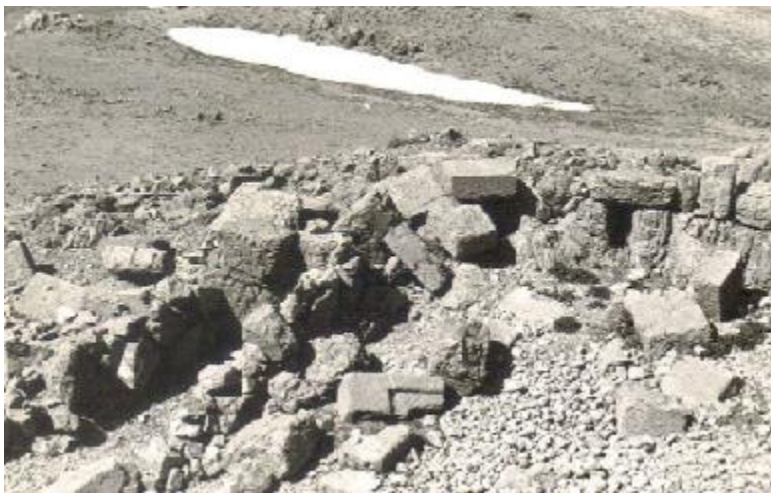
Ruins of Qasr Antar near the summit of Mount Hermon

The “Gates of Hell” or “Gates of Hades” to which Jesus referred in the New Testament (Matthew 6:18) is a physical cave located near Caesarea Philippi at the base of Mount Hermon (also known as Baniyas or Panias), and out of which flows streams of water from the snow melt of the mountain. Niches were long ago carved into the rock face over the cave entrance to hold