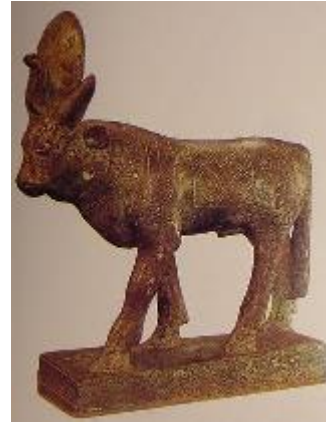
Egyptian god Apis Figurine

As described in the book of Enoch, the sons of God were also apparently instrumental in corrupting people yet another way – by false religious teaching: astrology, divination, magic, and sorcery: 26