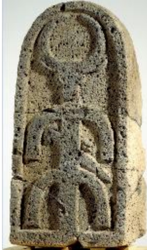
Baal Stele from Bethsaida