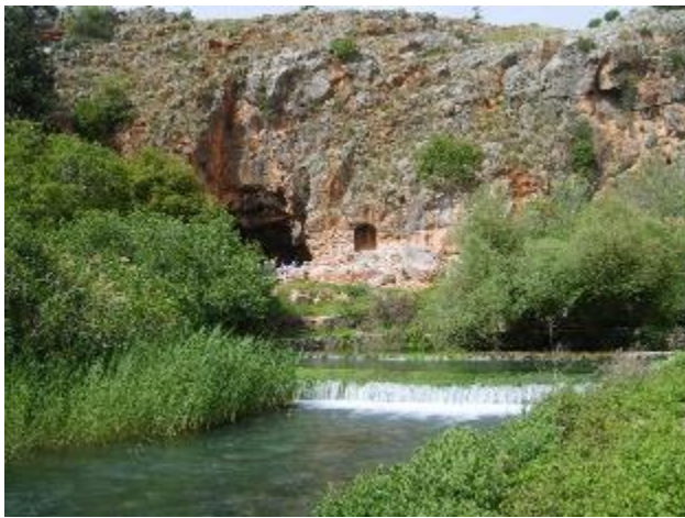
Water flow from the Gates of Hell