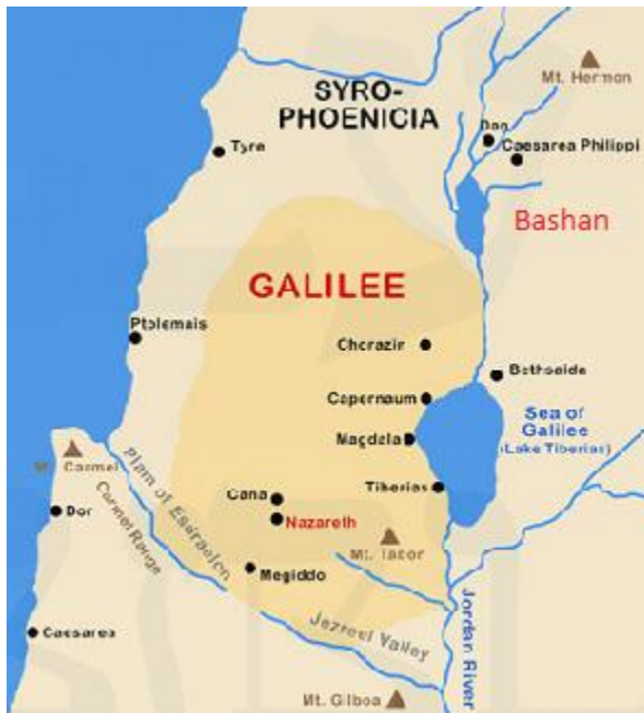
Map of Galilee (northern Israel)

And Shemihazah, their chief, said to them, “I fear that you will not want to do this deed, and I alone shall be guilty of a great sin.” And they all answered him and said, “Let us all swear an oath, and let us all bind one another with a curse, that none of us turn back from this counsel until we fulfill it and do this deed.” Then they all swore together and bound one another with a curse. And they were, all of them, two hundred, who descended in the days of Jared onto the peak of Mount Hermon. And they called the mountain “Hermon” because they swore and bound one another with a curse on it. (I Enoch 6:3-5)